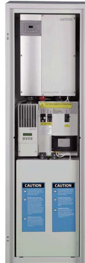
Front View (Open Door)

➤ The Kokam Solar Integration System (SIS) is a cost-effective energy management system that captures solar energy and stores it for use when it's needed most, thereby optimizing peak load reduction, improving grid reliability, and maximizing return on renewable energy investments. With an innovative grid-tied model that integrates the latest in lithium-ion energy storage, a unique hybrid inverter/converter, and a software platform that aggregates, monitors, and controls distributed generation and stored energy, Kokam aligns the goals of residential consumers, commercial and industrial customers, and electricity utilities to help solve the energy problems of today and tomorrow.